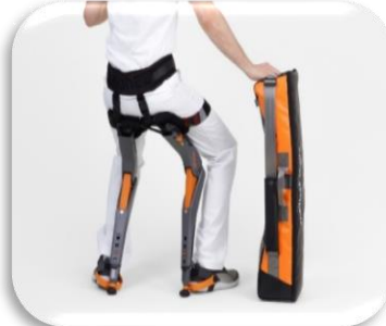
Chair Less Chair