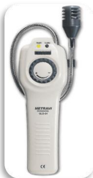
Combustible Gas Detector