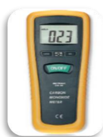
Carbon Monoxide Meter